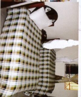
WEST WIND HOTEL DOUBLE BED