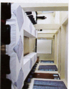
WEST WIND HOTEL BAR