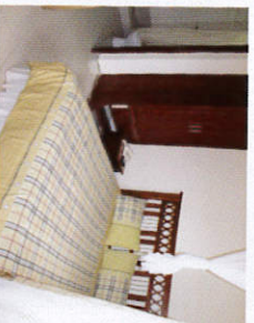
WEST WIND HOTEL DOUBLE BED