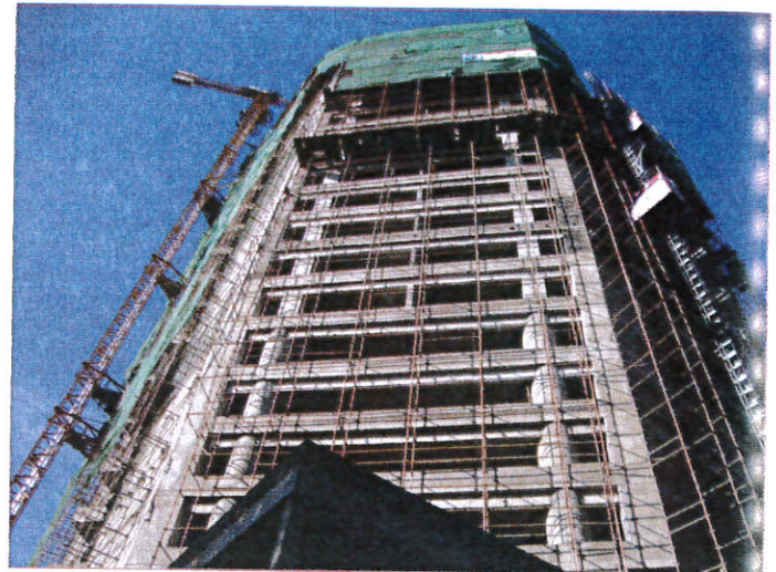
The building is easily accessible from Valley Rd and Ngong Rd

Served by an excellent road infrastructure, 4 th Ngong Avenue Towers is easily accessible from Valley Road or Ngong Road through Bishop Road. It is a few minutes drive from the Nairobi CBD and is close to several Government ministries and the Milimani commercial law courts which make the office block ideal for law firms, NGOs, professional firms and commercial enterprises.