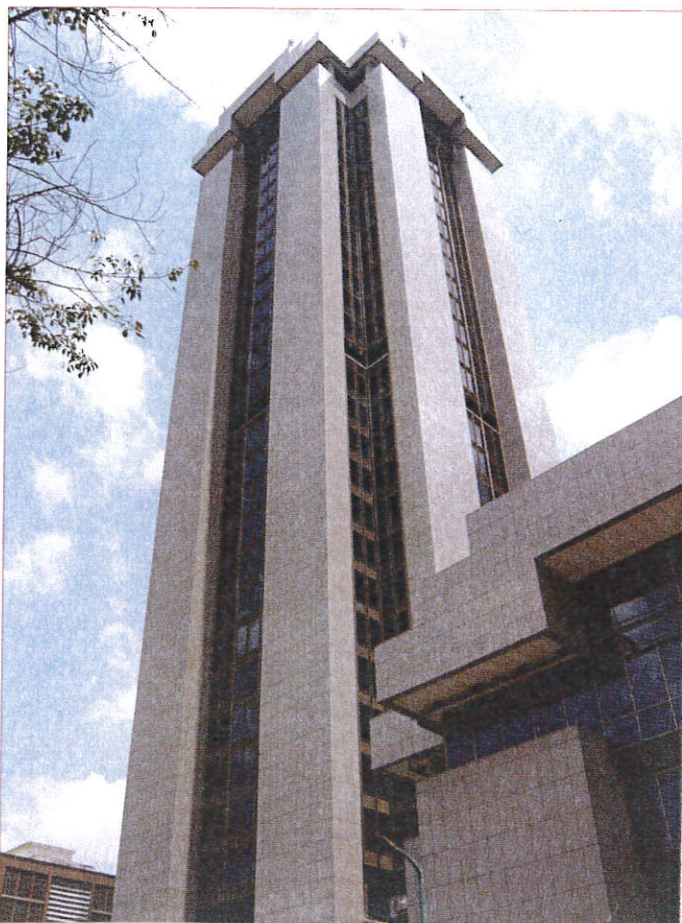
Times Towers: One of the many buildings designed by Triad

The firm which highly cherishes the core values of teamwork, excellence and integrity has a highly qualified and experienced staff comprising of architects, project managers, technicians and office administration personnel who are based in the firm's offices in Nairobi, Kampala and Kigali.