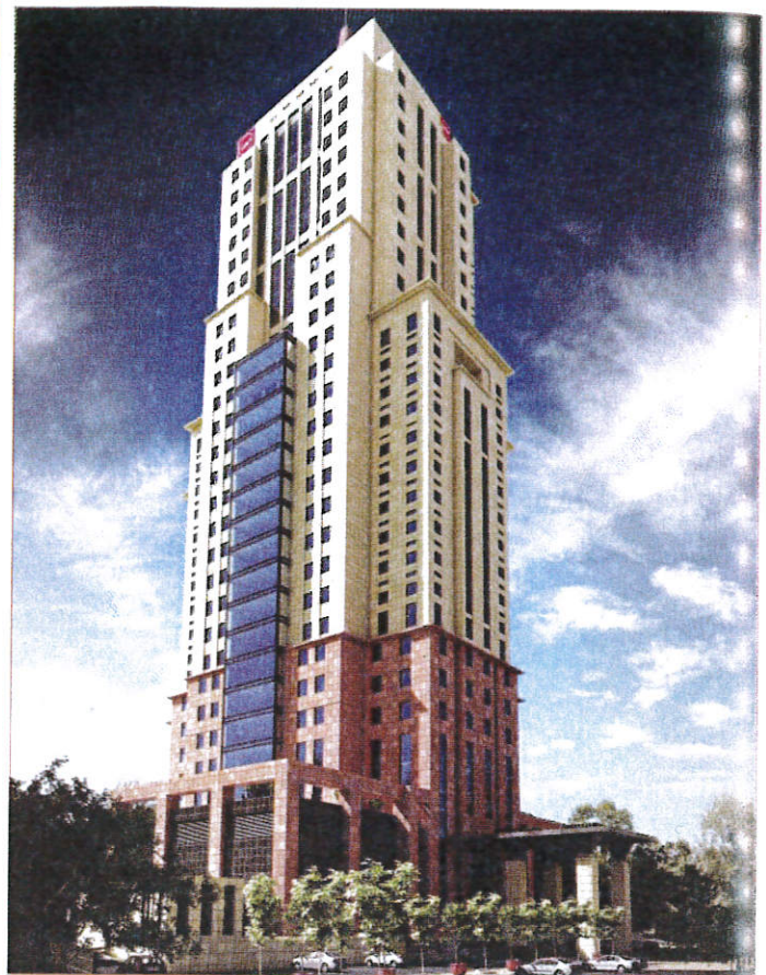
UAP Towers: An ongoing Triad project

Triad, whose history roles back to the days when Kenya attained independence, has made a significant contribution in shaping the country's architectural landscape. Among the buildings that Triad has designed in Nairobi are Times Towers, Corners House, Loita House, Nairobi Business