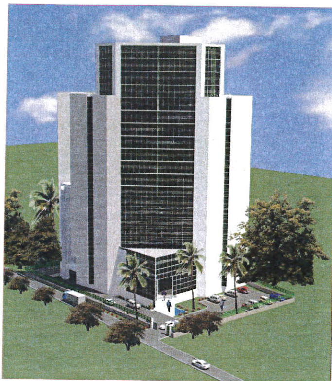
The building has 297 parking spaces

Other amenities that make the office block a safe and pleasant working environment include: