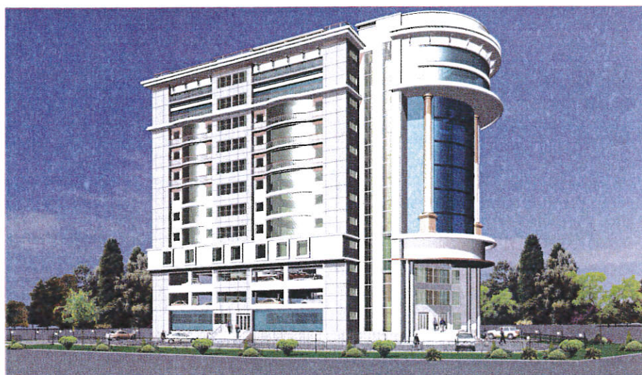
Flamingo Towers is a clean, secure and easily accessible office complex

Located on Mara Road next to the British High Commission and the Embassy of Japan, Flamingo Towers