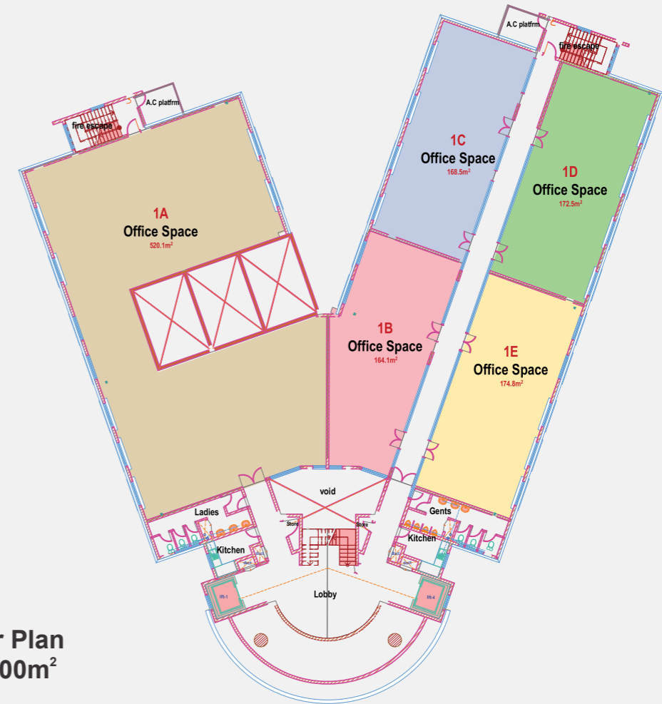
First Floor Plan Area = 1,200m 2