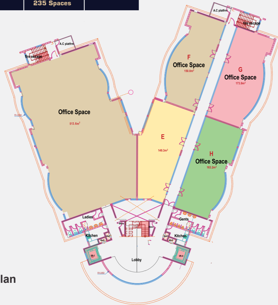
Typical Floor Plan Area = 1,150m 2